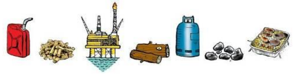
Fuels include gas, coal, wood, petrol, diesel etc.

A deadly gas that can be emitted from faulty cooking and heating appliances powered by any carbon based fuel that burns.