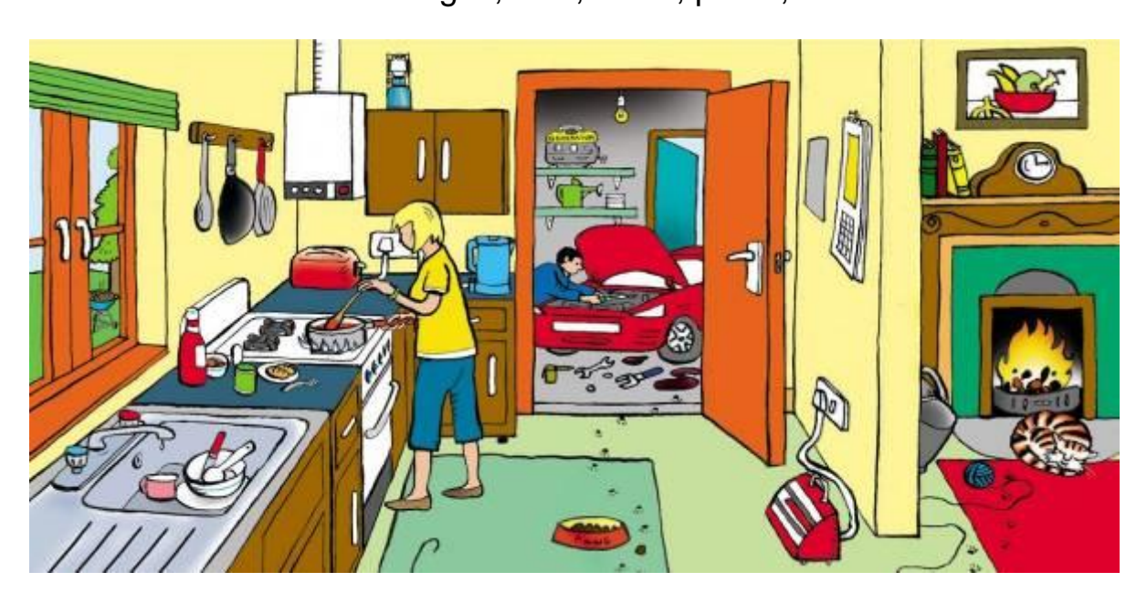
Can you identify potential sources of carbon monoxide in the picture above? For the answers go to <a href="http://www.co-gassafety.co.uk/answers.html">http://www.co-gassafety.co.uk/answers.html</a>